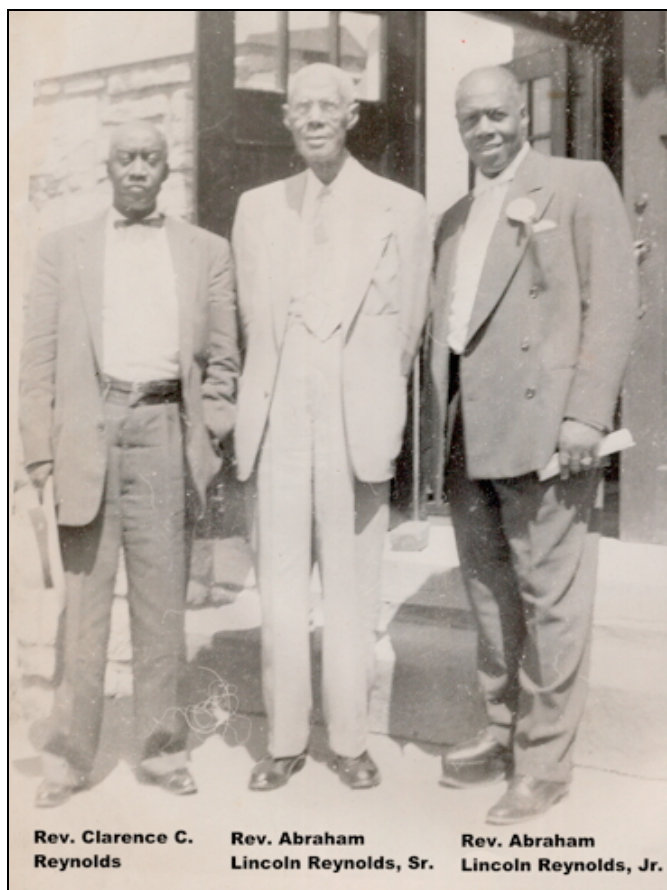
Father and sons.