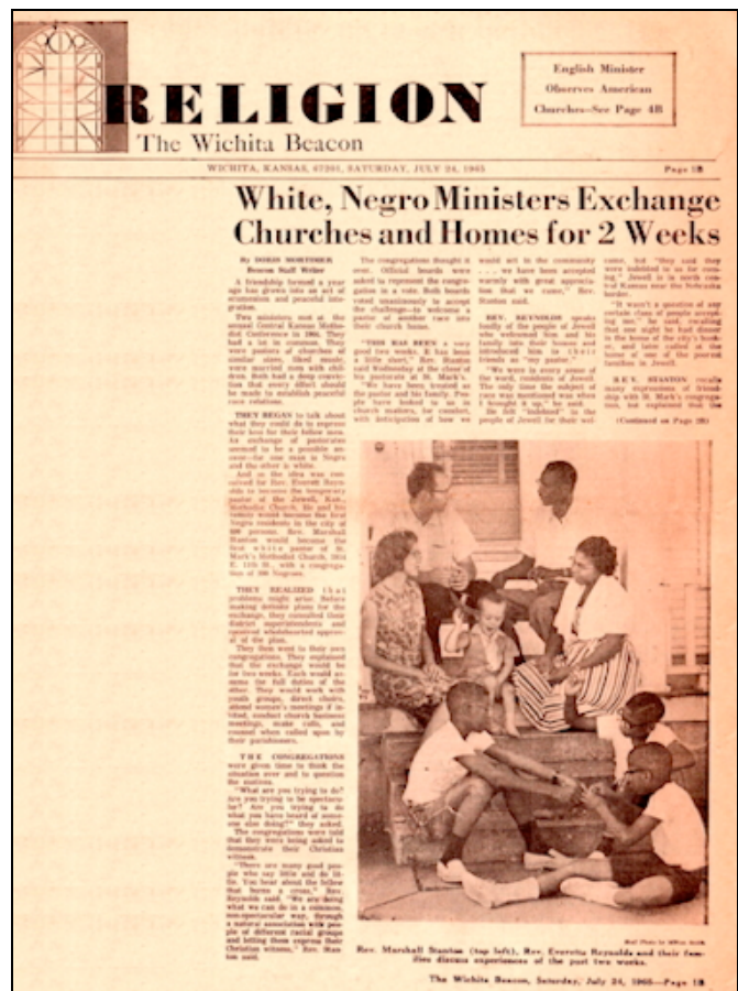
Wichita Beacon, Saturday, July 23, 1965